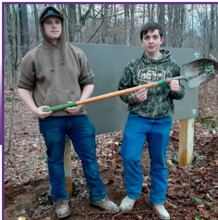
Pictured Right: Service Project: Building a patterning board & range!